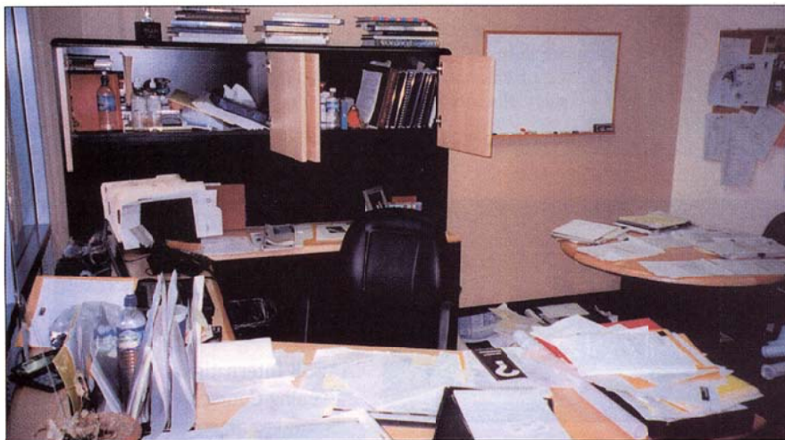
Does your office resemble this?

"We change people's lives," she says, "by turning an office or business into a productive working environment." That, in turn, relieves stress and saves money. She adds, "We give you the gift of time." ♦